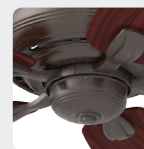
NO-LIGHT SWITCH CUP